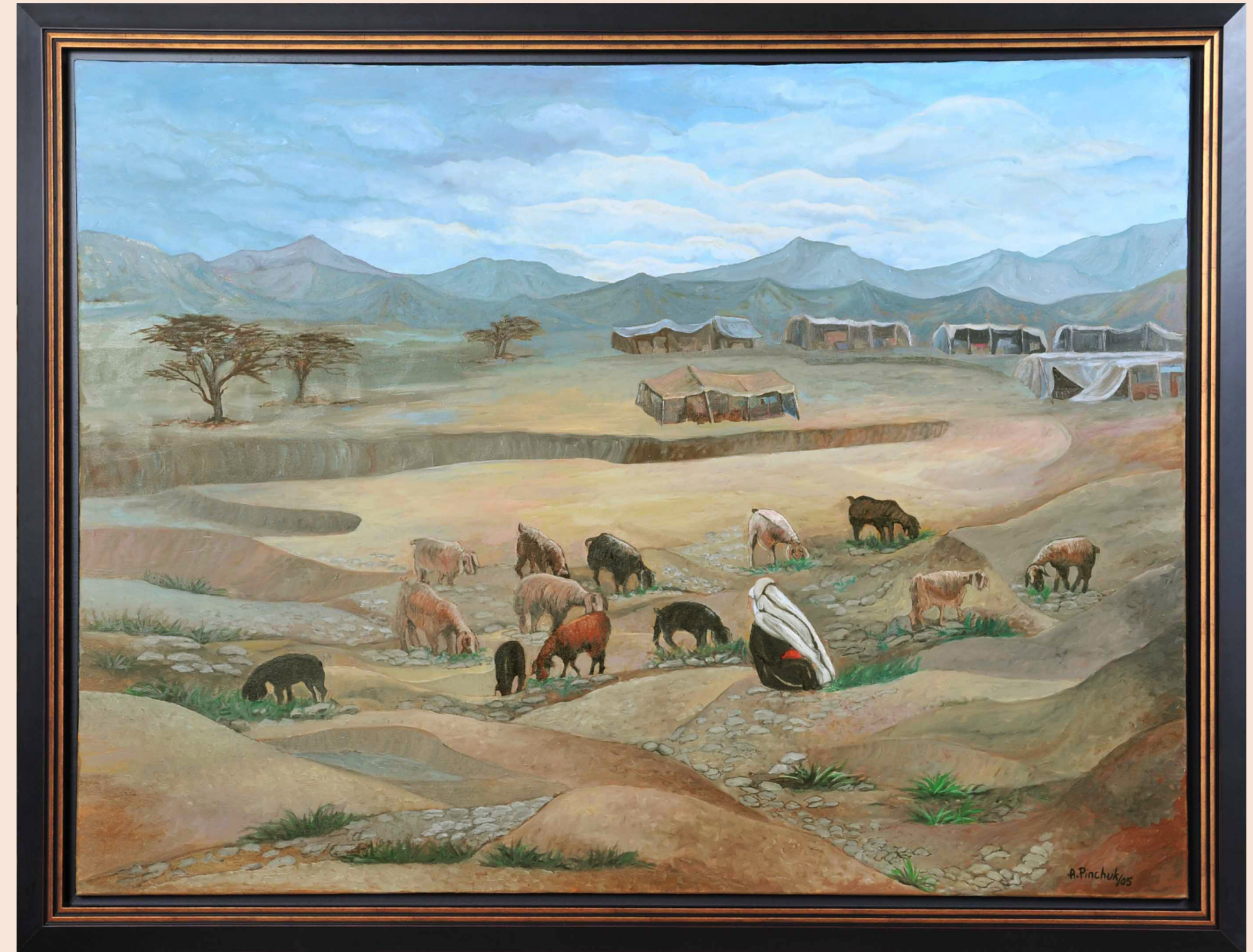
A BEDOUIN CAMP (2005) Oil on Canvas, 36 x 48

The land is unforgiving Scarce is the grass A Bedouin tends her goats Calm fills the air