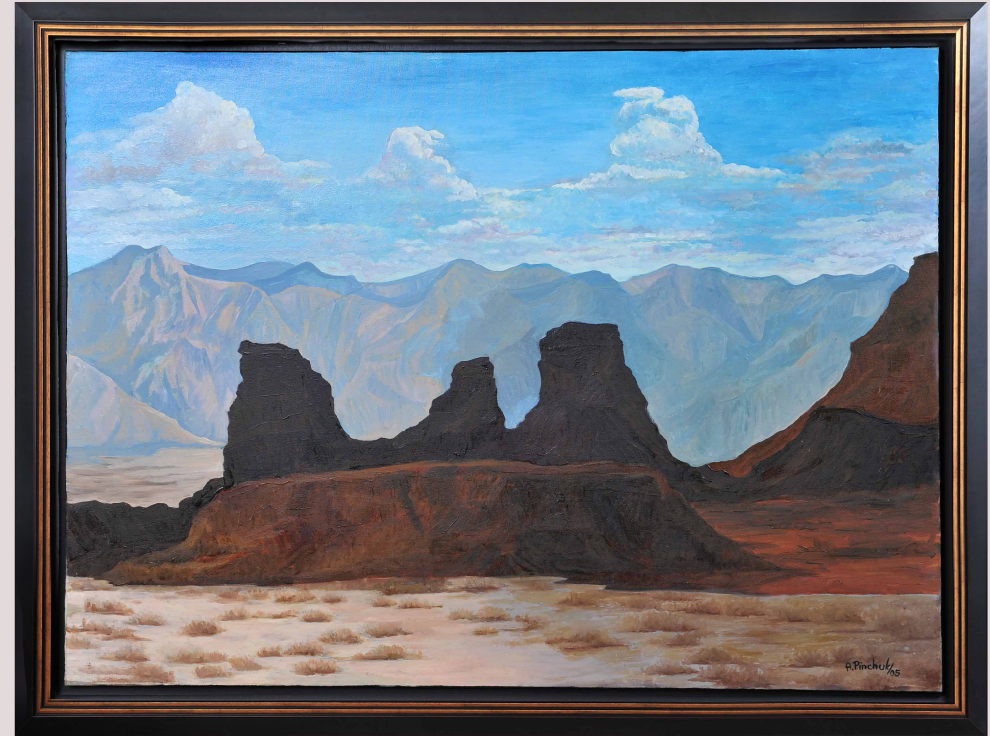
NATURE'S SCULPTURE (2005) Oil on Canvas, 30 x 40

Sculptures carved from mountains A rainbow of colours grace the land Grandeur of untold beauty Shaped by nature's hand No artist can compete