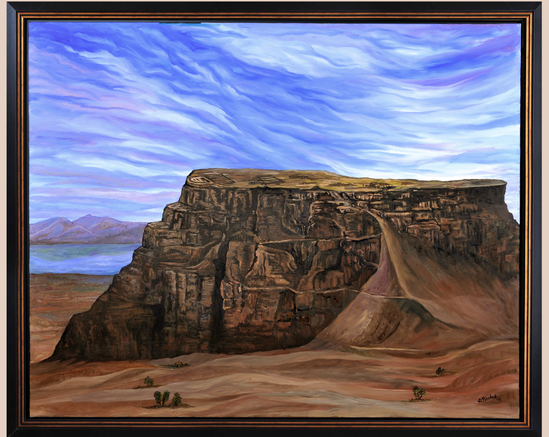
MASADA: A MOUNTAIN OF COURAGE AND DEFIANCE (2011) Oil on Canvas, 48 x 60

Masada, what do you hide in your mountain? Your stones are soaked with blood and sorrow Yet your history is rich with courage and hope You are an island of strength for our people Determined to build a future in peace.