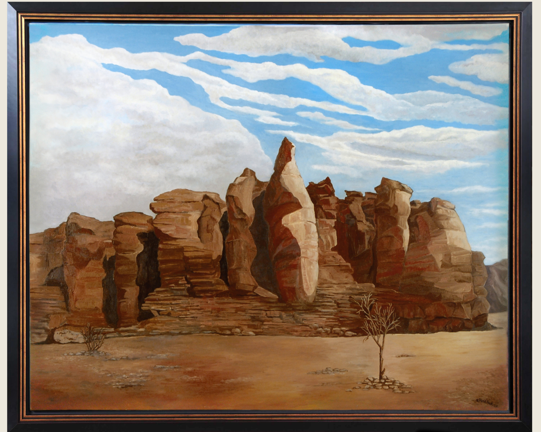
KING SOLOMON'S MINES (2005) Oil on Canvas, 48 x 60

In the Timna Valley Majestic pillars Touch the clouds The earth a mystery holds Solomon the Wise Found treasure buried deep For all to share