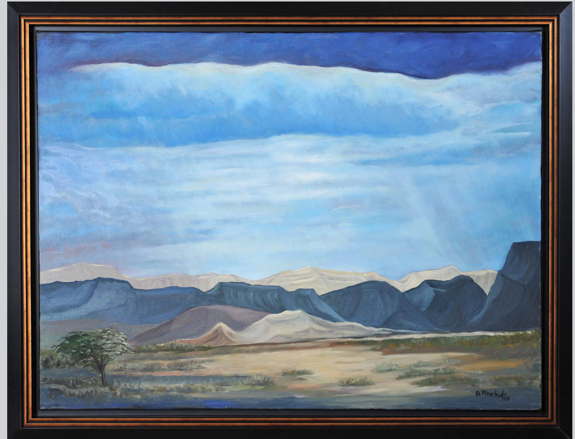
SUN RAYS OVER THE NEGEV (2005) Oil on Canvas, 30 x 40

Rain clouds above Enrich the earth From the dark skies A sunburst erupts Sending rays of hope and peace