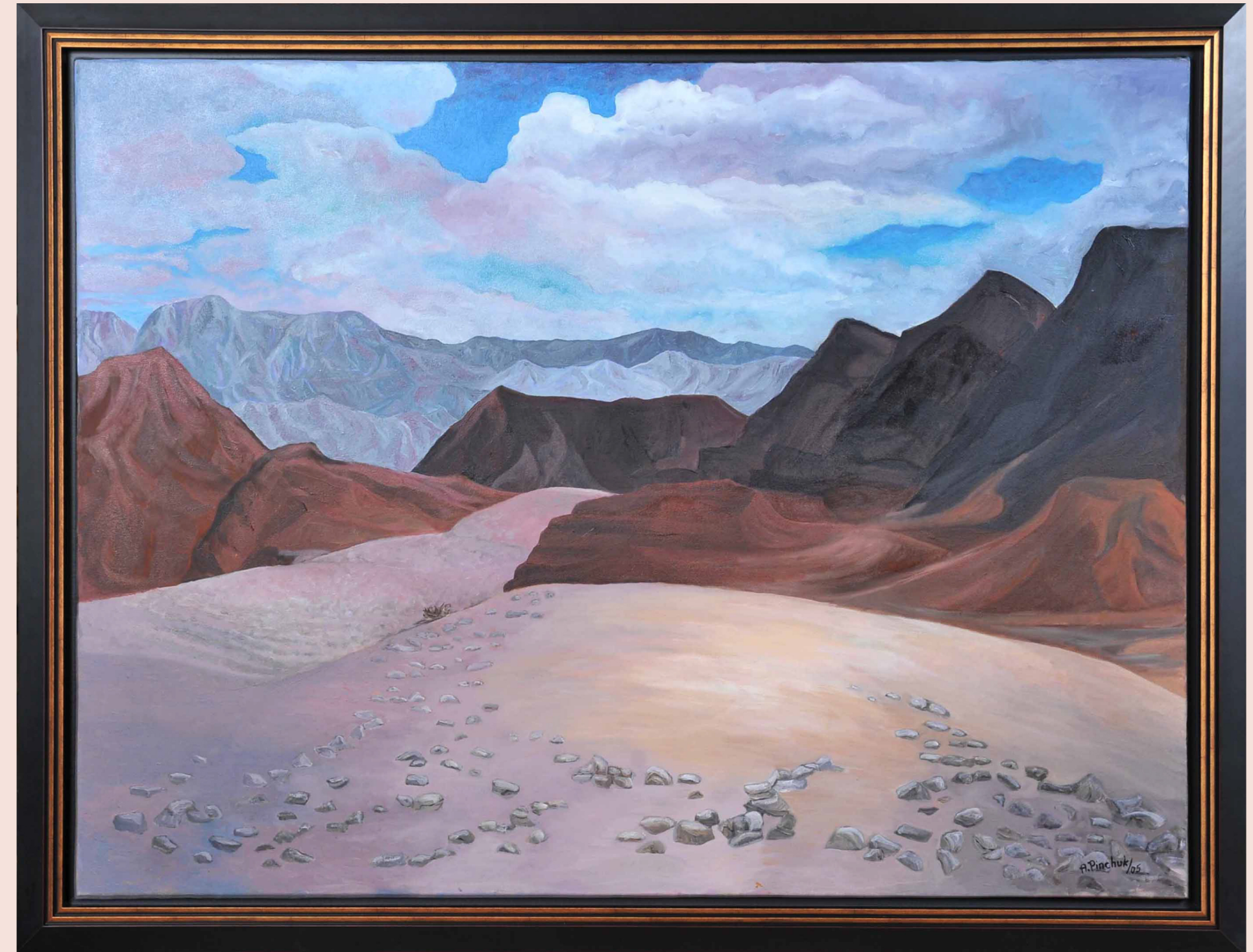
A DESERT SUNSET (2005) Oil on Canvas, 36 x 48

What joy the evening brings When the sun begins to set The clouds reflect its colours As the desert prepares to rest