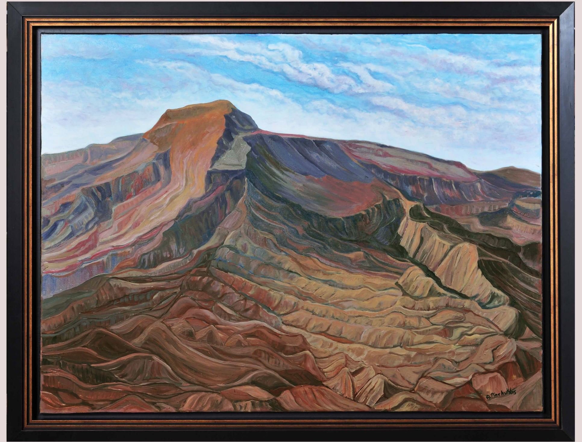
THE RAMON CRATER (2005) Oil on Canvas, 30 x 40

Wherever the eye wanders In the vast crater of shapes Visions of beauty appear How spectacular is nature When not disturbed