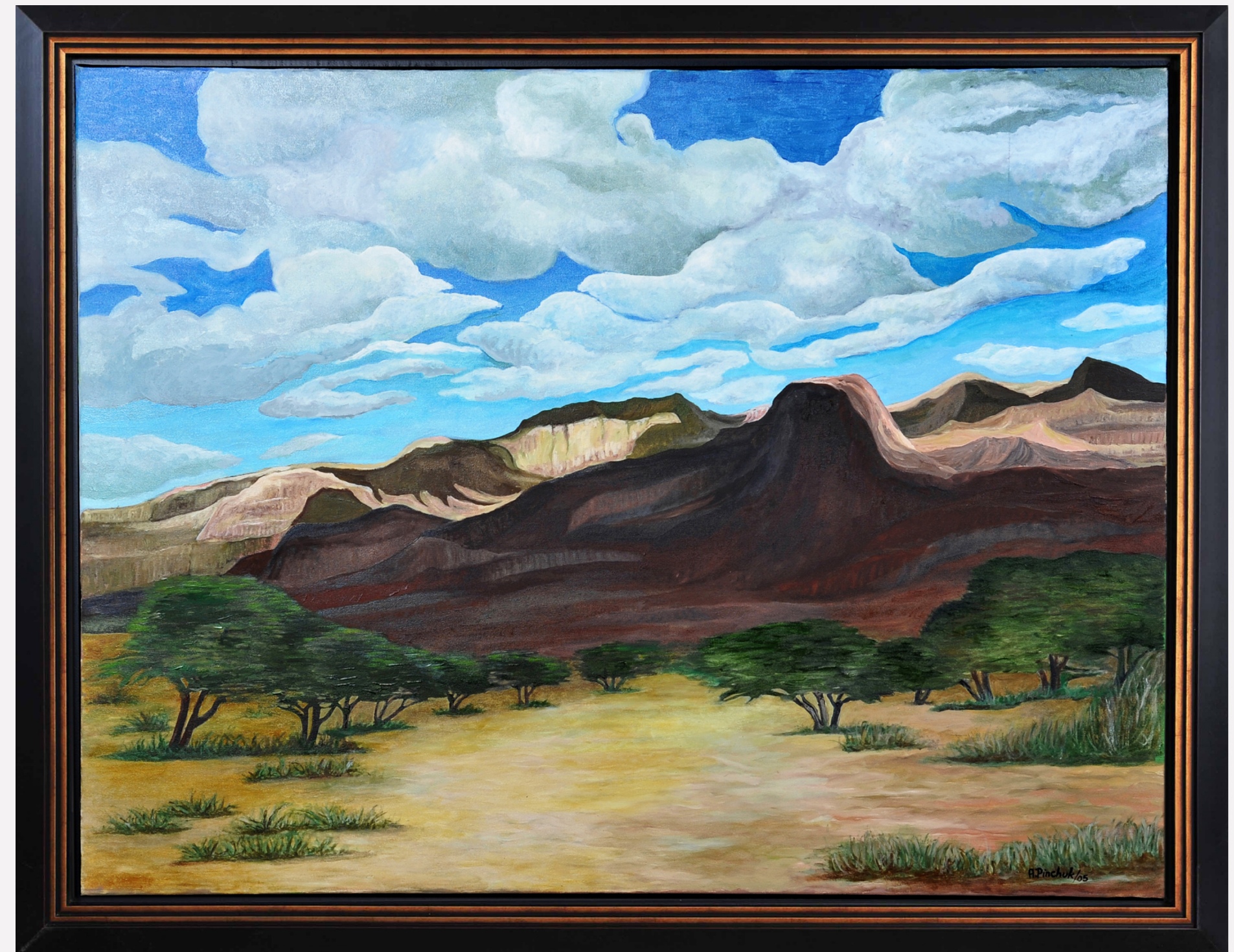
WINTER CLOUDS IN THE NEGEV (2005) Oil on Canvas, 36 x 48

Clouds float by an aging mountain The trees shed their seeds A forest springs out of the earth A gift from the barren desert